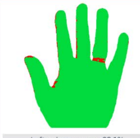
Left palm coverage: 98.1%