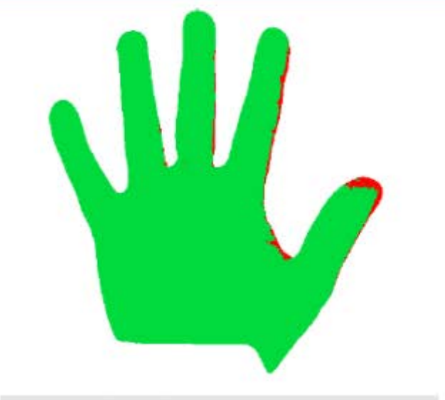
Right palm coverage: 97.7%