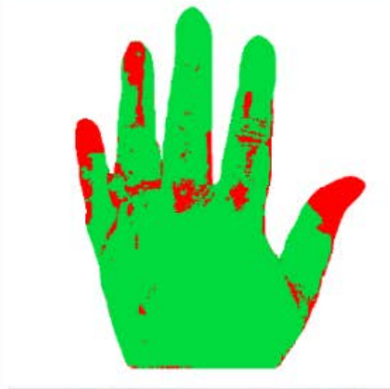
Left dorsum coverage: 86.5%