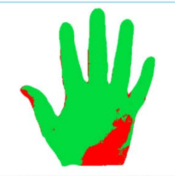
Right dorsum coverage: 89.2%